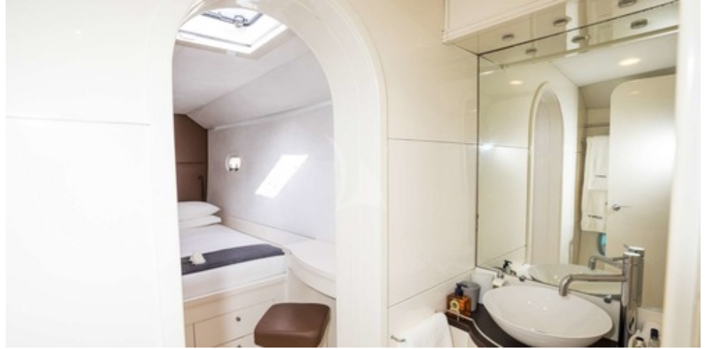
MAGIC CAT - Cabin 1