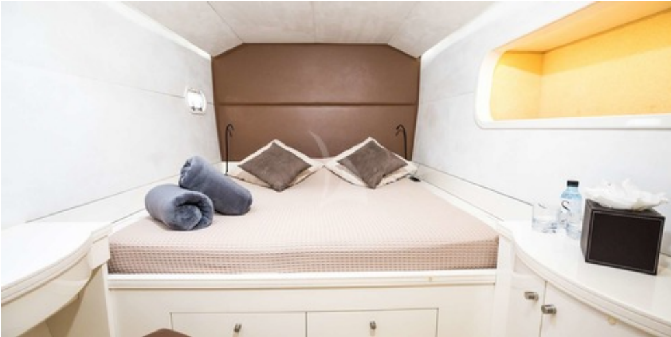
MAGIC CAT - Cabin 2