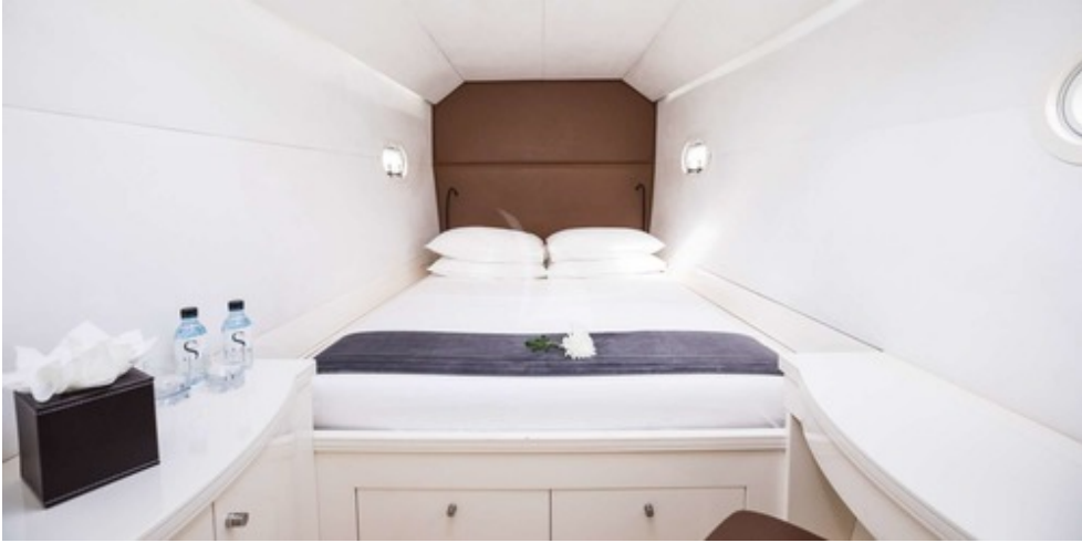
MAGIC CAT - Cabin 1