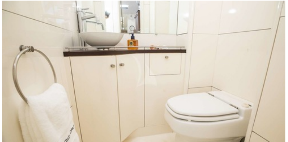
MAGIC CAT - Head