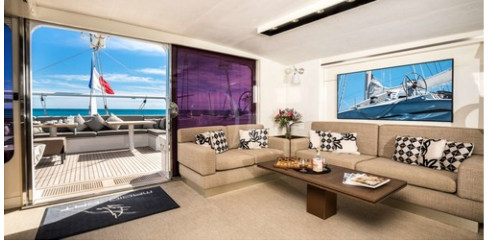
MAGIC CAT - Saloon