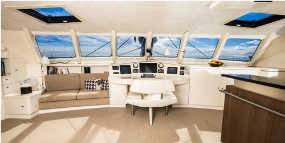
MAGIC CAT - Saloon