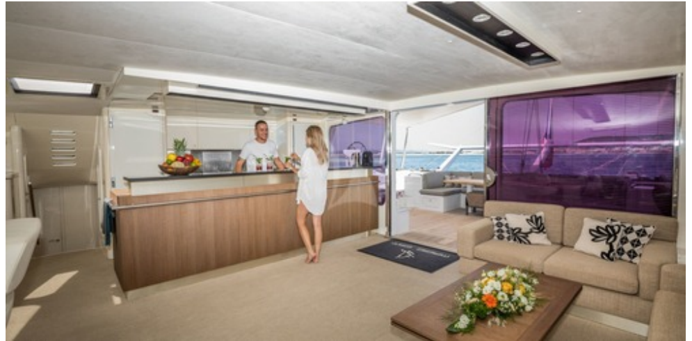
MAGIC CAT - Galley