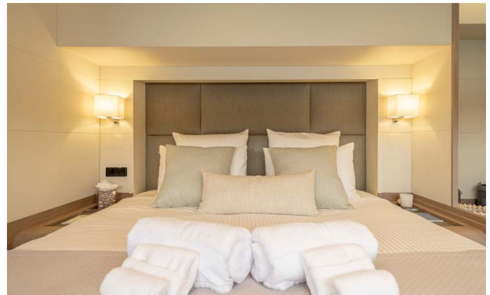
Alegria 67 Semper Fidelis