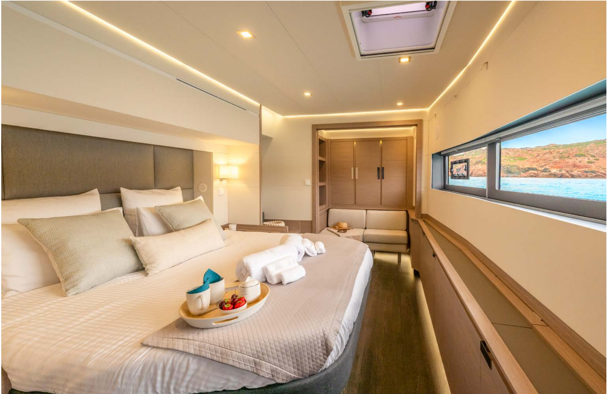
Alegria 67 Semper Fidelis