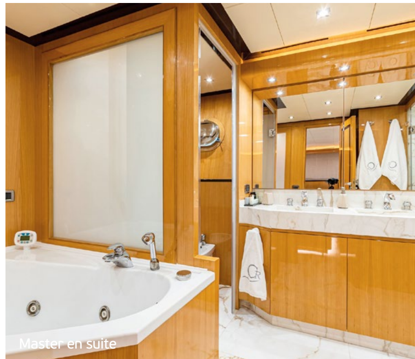
Master en suite