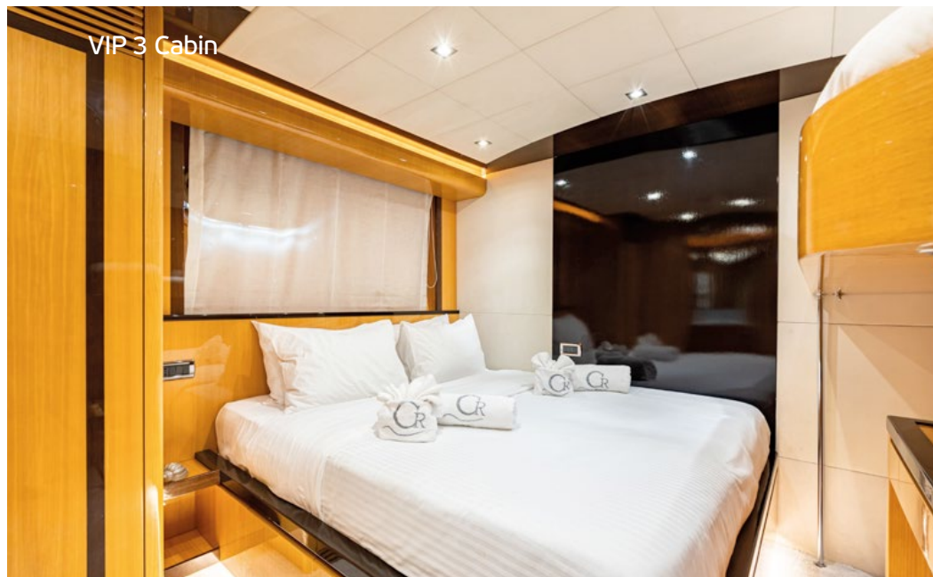
VIP 3 Cabin