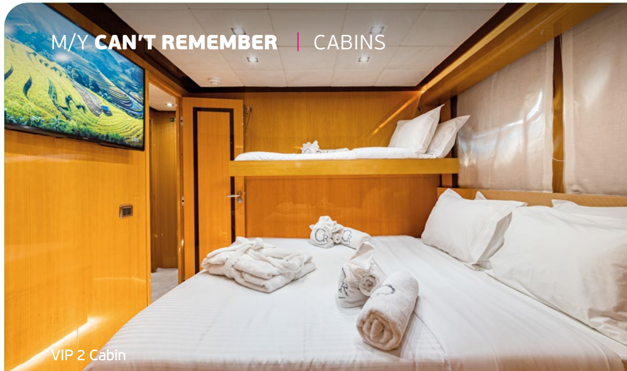
VIP 2 Cabin