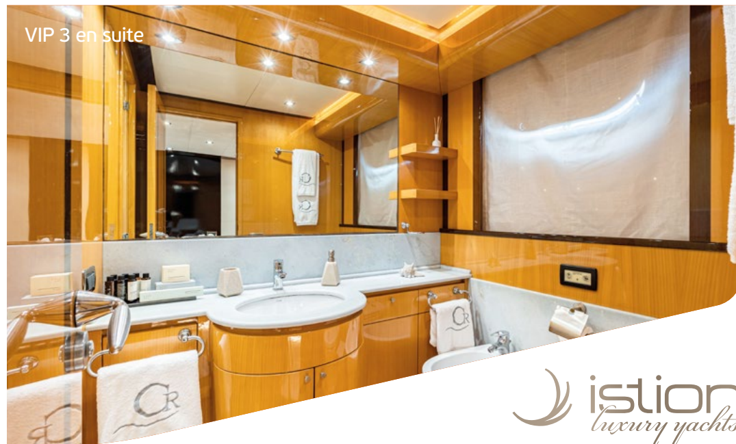
VIP 3 en suite