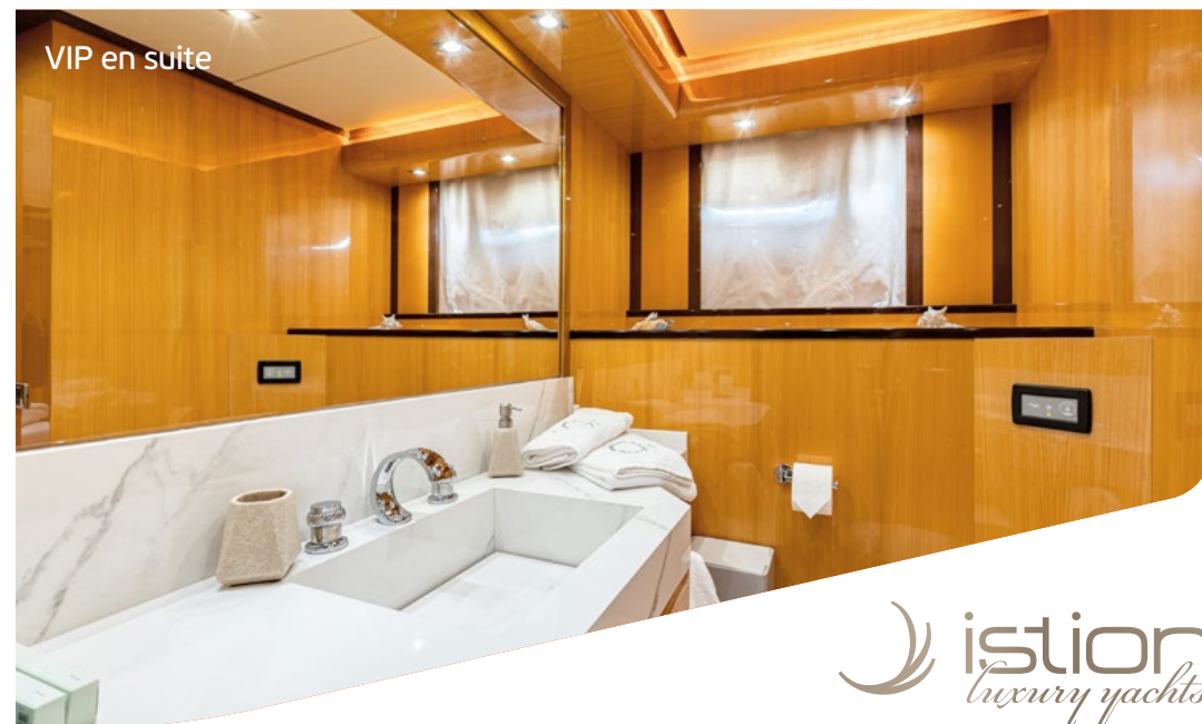
VIP en suite