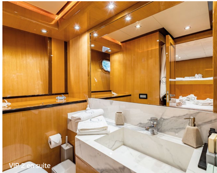
VIP 2 en suite